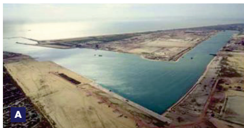
A Areal view of the areas 1 and 2 access navigation channel.

The total dredging volume was 51.751.753 m 3 , of witch 31.041691 m 3 were removed by Cutter Suction Dredgers (CSD), and 20.710.062m 3 removed by Trailing Suction Hopper Dredgers (TSHD).