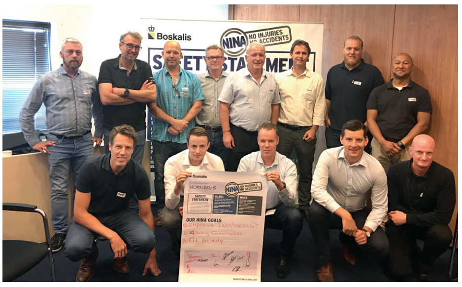
| The Hornsrev project team during the NINA Start-up meeting

Off the coast of Denmark, Boskalis is installing 50 cables at the Hornsrev wind farm. This is a technically and logistically challenging project, with many contractors and subcontractors and hired tradespeople. Good coordination is therefore crucial for safety and quality. That is why the Start-up got a lot of attention.